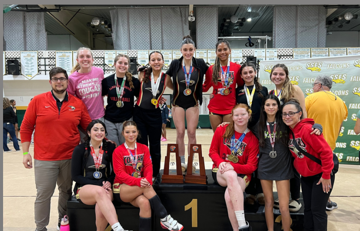
Girls Weightlifting team finished District Runner Up Regionals are up next!