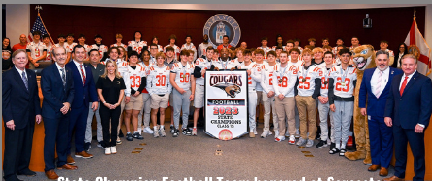
State Champion Football Team honored at Sarasota Commissioners meeting