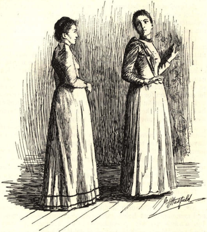
"She didn't know I was in the Room."

John says I mustn't lose my strength, and has me take cod liver oil and lots of