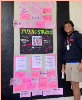
Last year's Breast Cancer Prayer Wall.

Next week, our Cougar Prayer Wall will focus on all of our prayers relating to Breast Cancer Awareness Week here at Mooney.