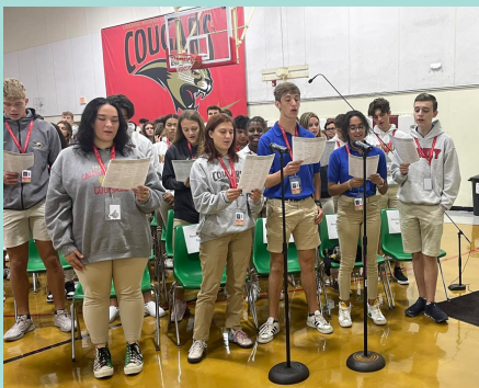
We celebrated our first All-School Mass.