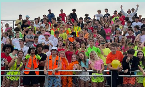
Cougar Crazies filling our stands; join us for all the fun campus activities!

Thank you to the more than 60 students who donated blood to the Suncoast Blood Bank. We exceeded our goal and had many first time donors!