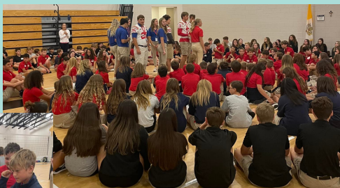
Campus Ministry students visited with St. Martha students