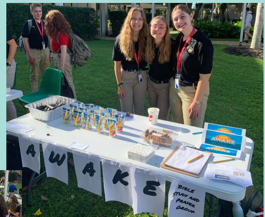
Club Rush was well attended and showcased all of our amazing clubs. Look in Canvas for Club descriptions and meeting locations.