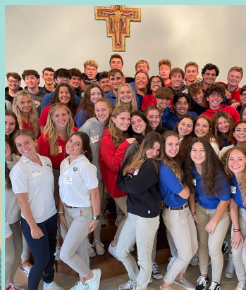
Campus Ministry students ready to lead!