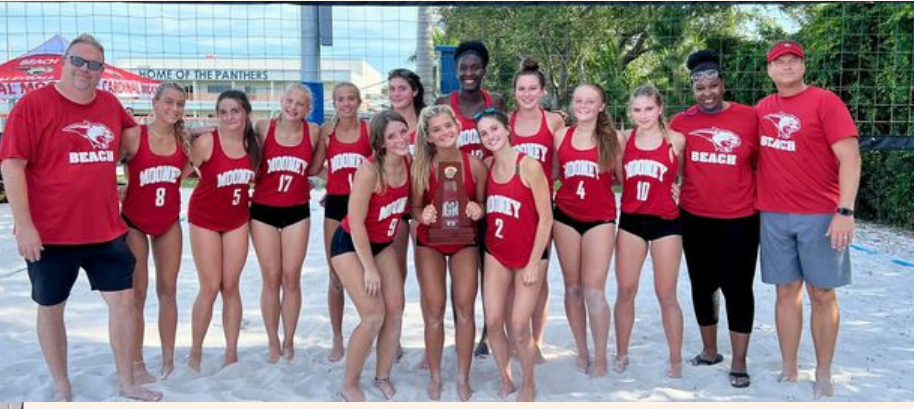
Beach Volleyball heading to Regionals