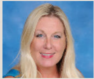
Ms. Lewis Students with Last Name A-K in Grades 9-11