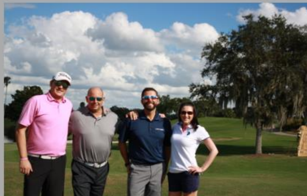
Capstan Financial Team