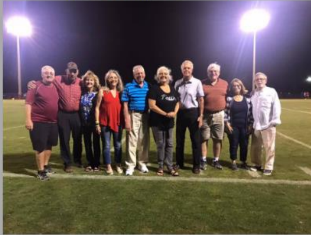
Class of 1968